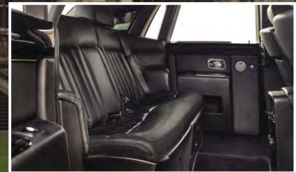
ROLLS-ROYCE PHANTOM VII (Interior)

Up to three passengers in the rear, and one in the front.