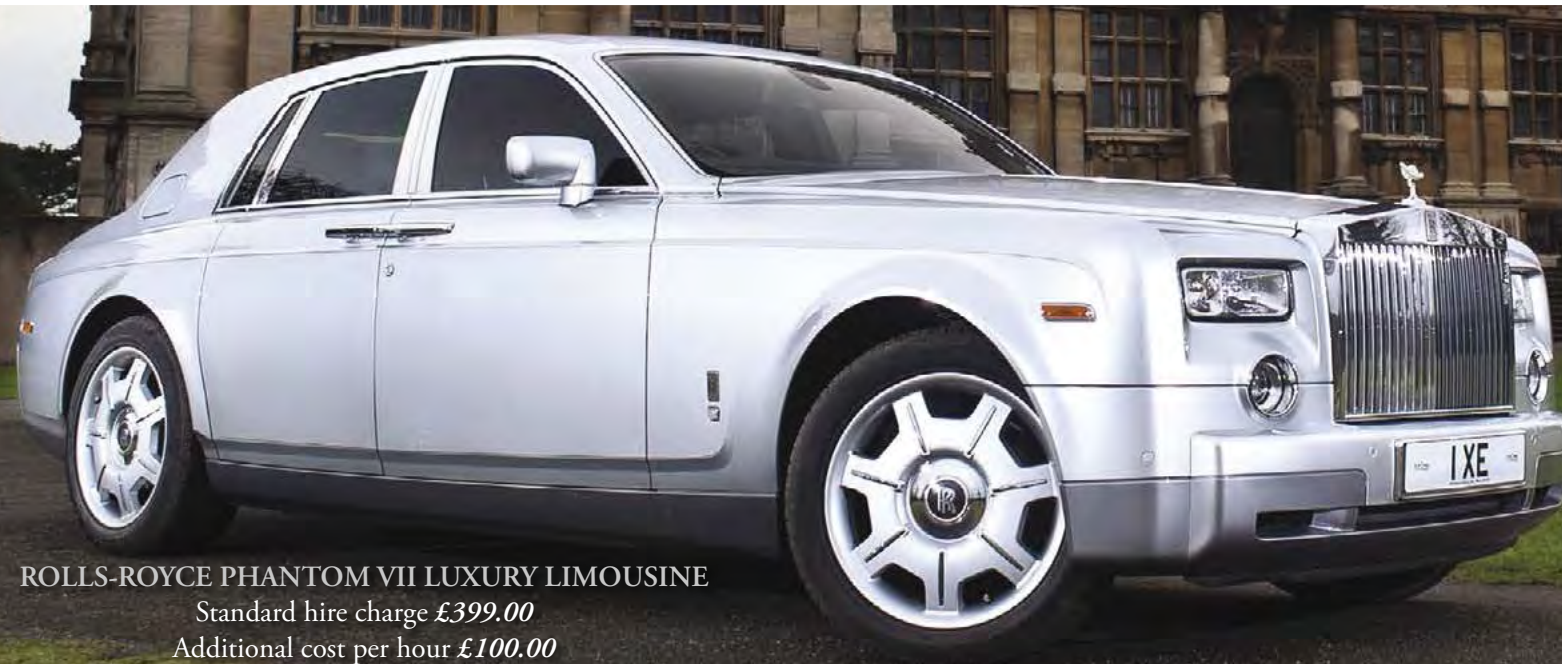
ROLLS-ROYCE PHANTOM VII LUXURY LIMOUSINE

The cars each seat different numbers of passengers including one in the front next to the driver, please check the individual specification of your vehicle choice.